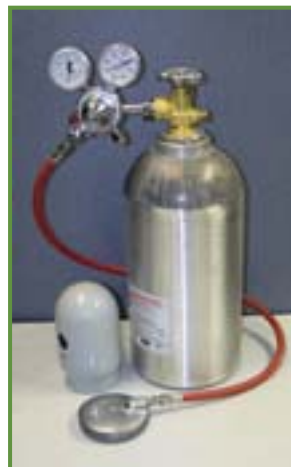
#171-31-1 Low-Pressuring Nitrogen Assembly