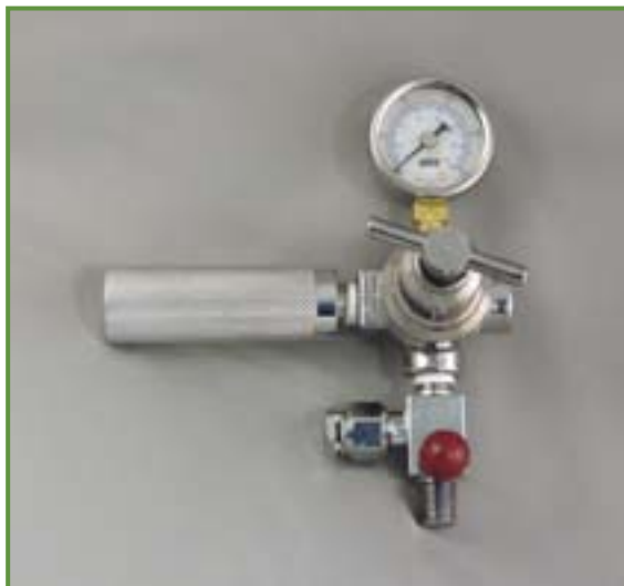
#142-10 CO 2 Pressure Assembly