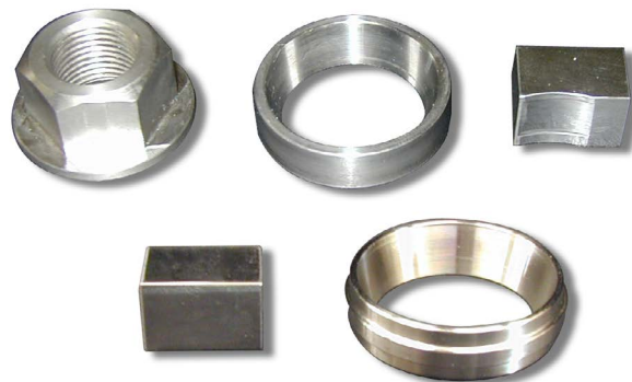
Top Row (Left to Right): Retainer Nut, Lubricity Test Ring, Lubricity Test Block Bottom Row: EP Test Block (Left), EP Test Ring (Right)