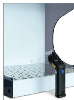
Flow demonstrated with a Dräger Flow Check.

Stand, open box-section framework, with feet or castors.