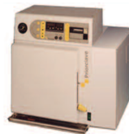
standard H60 with vacuum